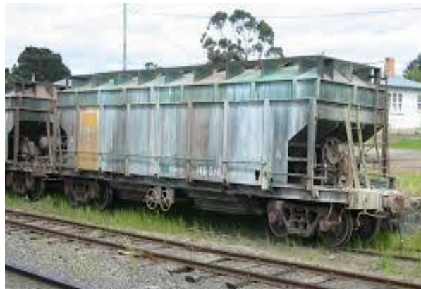
Waiting scrapping in Tassie