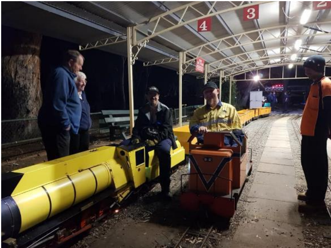
Easter Night Run