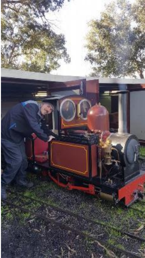
Steamin' up for 2019!