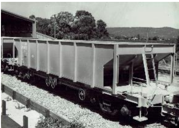
As built ex TOMLISONS 1965

Back home here, WESTRAIL converted 10 of the WSH to ng and hence the XM. The gauge conversion was done by pushing the wheels inwards on the axles. They look a little funny but work. Due to the high underframe height, a drop-down head coupler was used courtesy of the design talents of the late Mick Beavan.