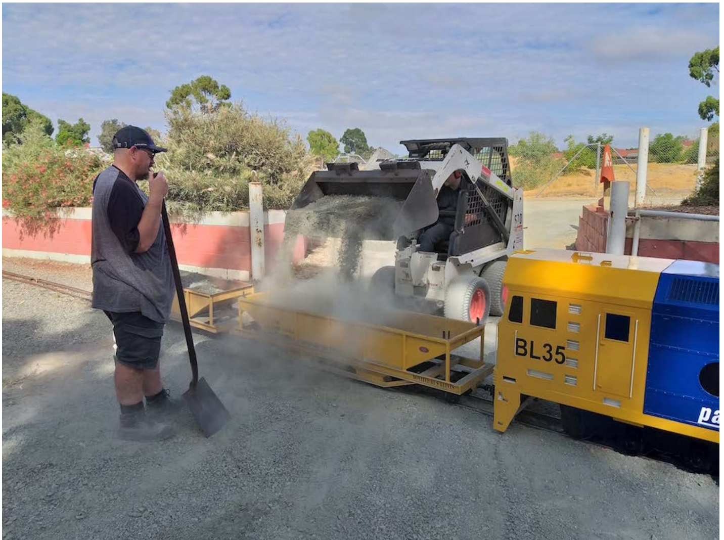
Craig supervising the ballast loading for the major maintenance works