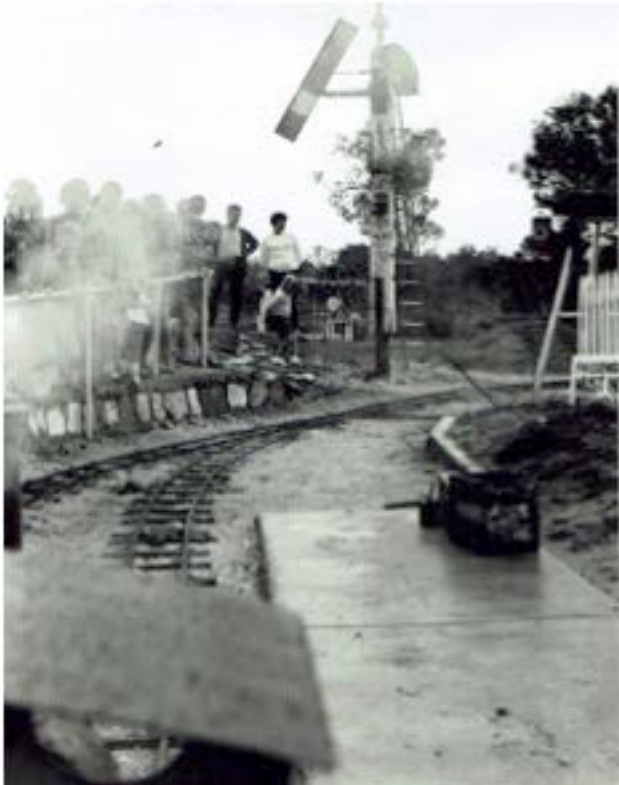
The genuine upper portion of a WAGR tumble arm signal was moved to WILSON PARK but after the post rotted away, it was not replaced. (It was a fair hunk of timber to purchase) The WAGR timber mill at Banksiadale cut timber to sizes to suit the railway and thus were not always commercial dimensions.