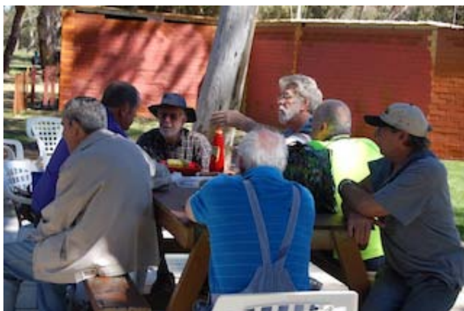
CMR members relaxing and chatting