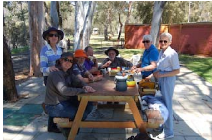
CMR members around the picnic table