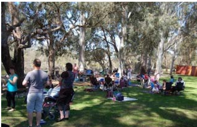
CMR members & friends in the picnic ground

◆◆◆CMR's 49 th Birthday Celebration Run◆◆◆