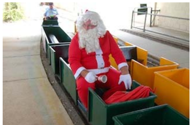
Santa arrives by train