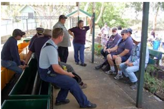
The train and station crews take a rest while Santa distributes the presents