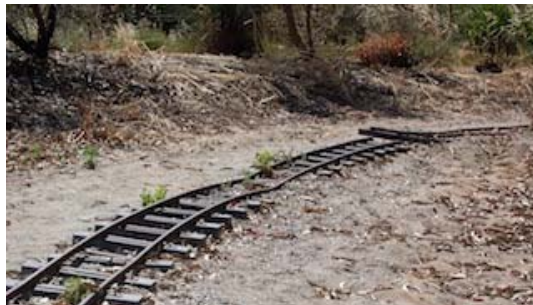
Above & below, damaged track at Fern Road