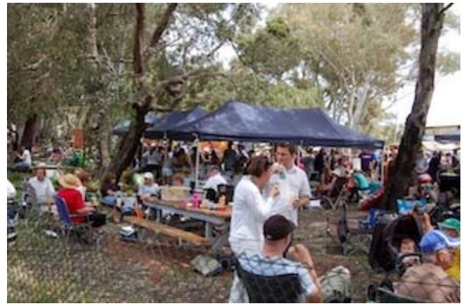
Crowds gather in the picnic ground