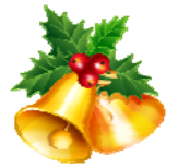
Conductive Education charity run day