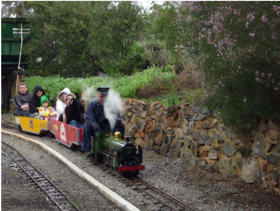
Intrepid passengers – A wet July Wilson run day