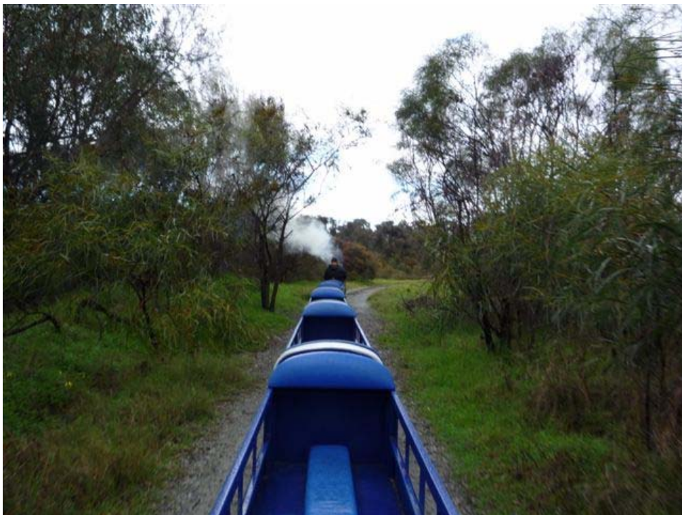
Empty train returning from Wilson, via the green wetlands, at the end of the day