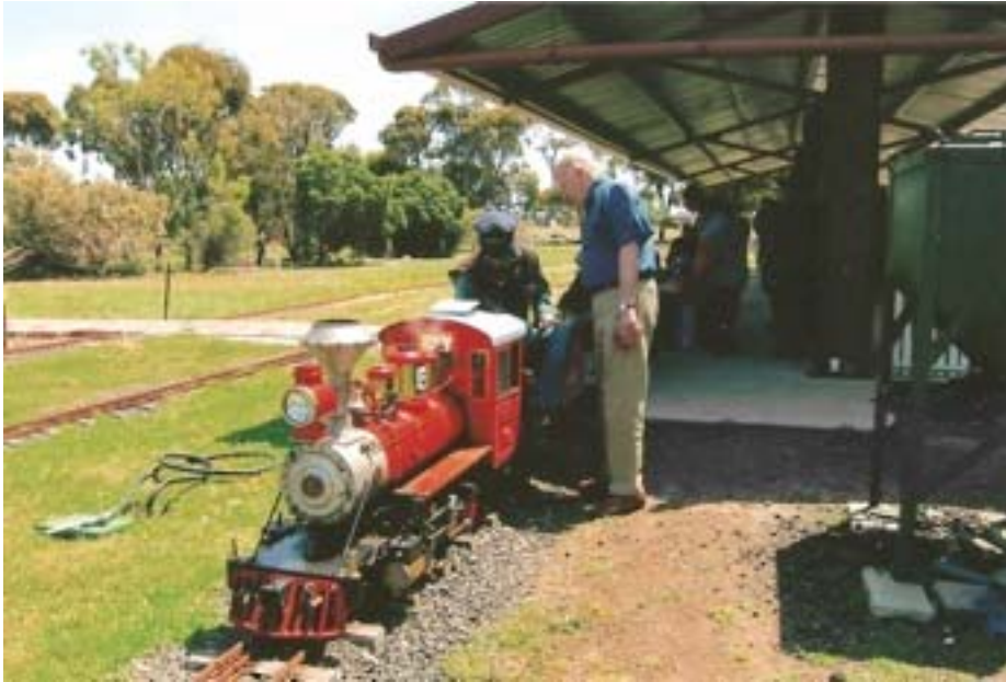
"La Quinta", 7¼" 2-6-0, I helped build in Perth many years ago.

The club has a great clubhouse used for meetings and special events. There is a big workshop where track and turnouts were under construction during my visit and work nights are a regular event. They also have a small café and the railway is well patronised by the local families.