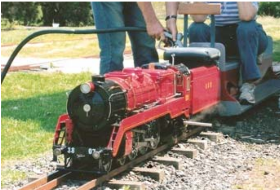
N.S.W. C38 class Pacific in a new bright colour.