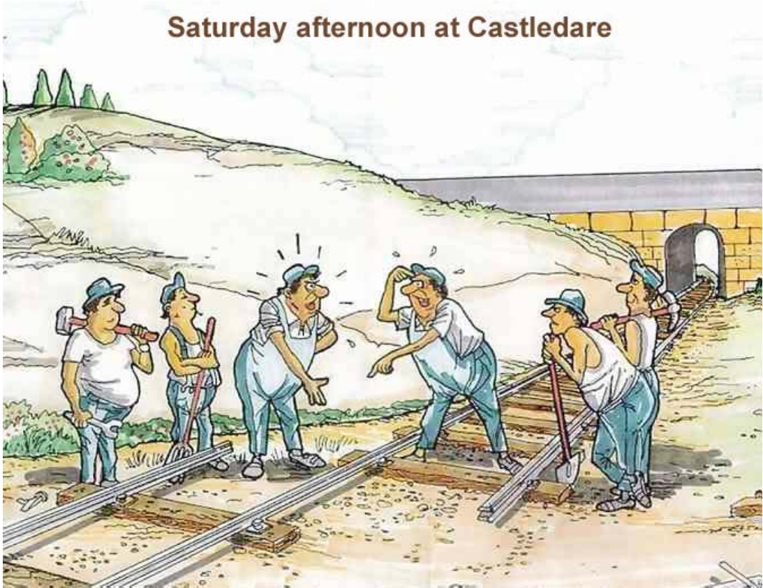
A reminder of the work ahead at Fern Road!