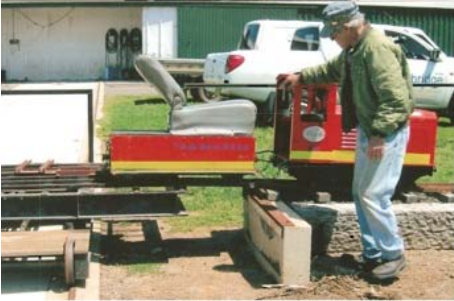
Traverser in action makes for easy loading & unloading.

Pictures and text supplied by: Keith Watson