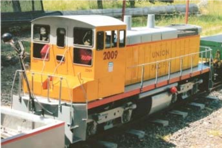
Union Pacific BO-BO Diesel loco, very powerful & easy to control by joystick.