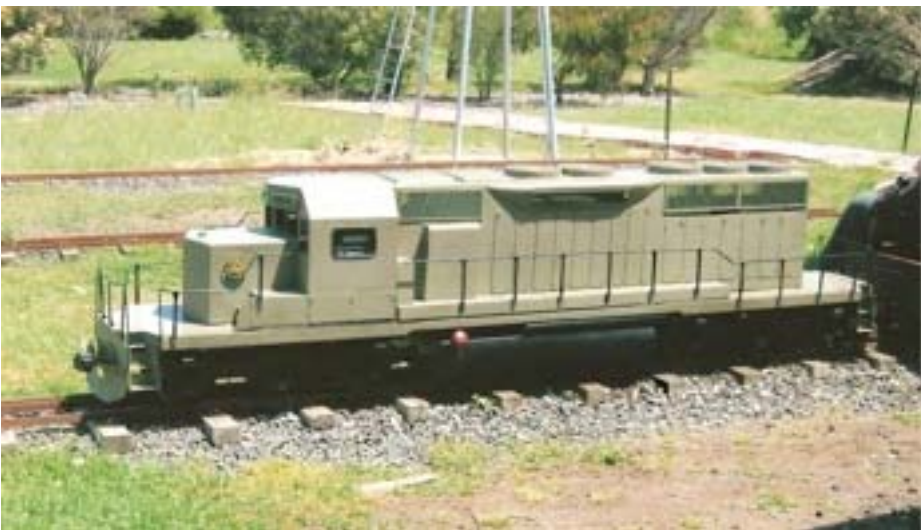
GM 7 1/4" Co-Co Diesel built in the USA & shipped here.