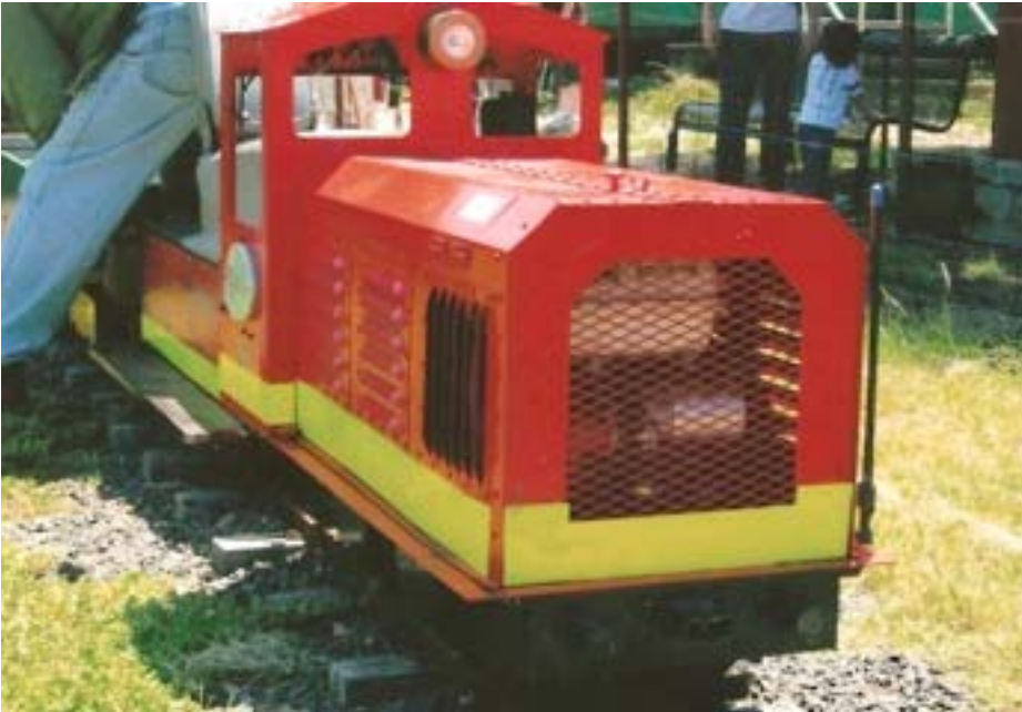
"Ella" Honda powered petrol loco, a great little workhorse.